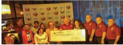
The Knights of Columbus proudly presenting the donation check to the NYS Special Olympics at the Barclay Center